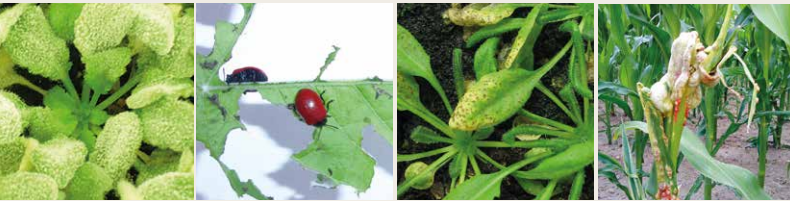
Some pathogens and pests being investigated in the research projects of the IRTG

The International Research Training Group is a cooperative PhD program between research groups of the Georg August University Goettingen (UGOE, Germany) and research groups of the University of British Columbia in Vancouver (UBC, Canada). It started in Goettingen in June 2016 funded by the German Research Foundation (DFG).