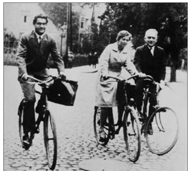
Fig. 2: Viktor Weisskopf, Maria Goeppert, Max Born