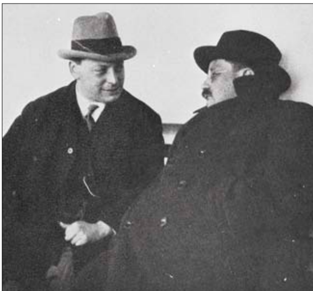
Fig. 1: Wolfgang Pauli and Paul Ehrenfest (1929)