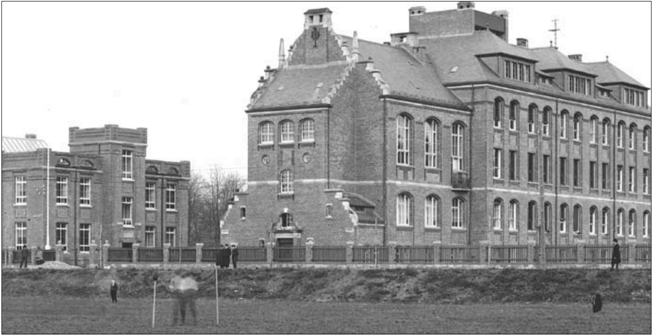
Fig. 3: I. Institute of Physics and II. Institute of Physics